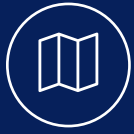
EXHIBIT BOOTH INFORMATION